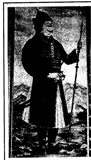
Maharana Pratap: Painting by Fine Arts Department of Bhavan's Jaipur Kendra

The Bharatiya Vidya Bhavan is privileged to adorn the cover page of this issue of Bhavan's Journal with the portrait of the legendary Maharana Pratap.